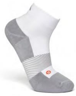
Quarter Length White