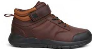
Trail Boot Whiskey