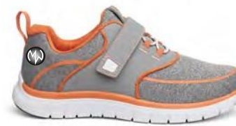
Sport Jogger Grey/Orange