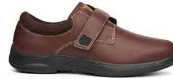
Casual Comfort Whiskey