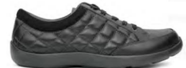
Casual Sport Black