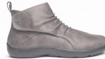
Casual Boot Grey