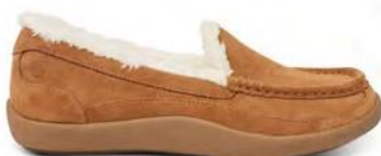
Moc Toe Camel