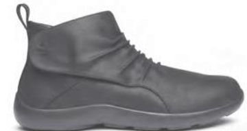
Casual Boot Black