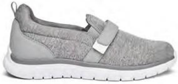
Sport Trainer Grey