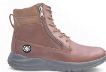
Trail Worker Whiskey