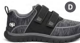
Sport Double Depth Black/Grey