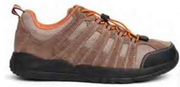
Trail Walker Stone