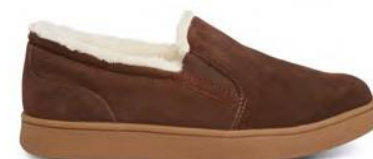
Smooth Toe Espresso