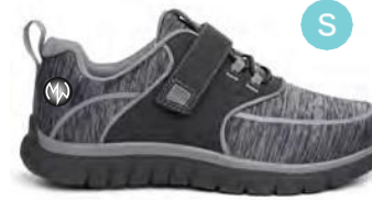
Sport Jogger Black/Grey