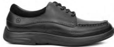
Casual Dress Black