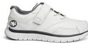
Sport Walker White