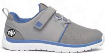
Sport Jogger Grey/Blue