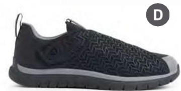
Sport Double-Depth Stretch Black