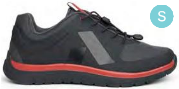
Sport Runner Black/Red