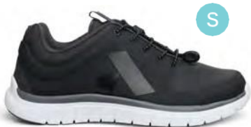
Sport Runner Black/Grey