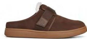
Open Back Espresso