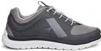
Sport Runner Grey/Black