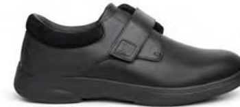
Casual Comfort Stretch Black Stretch