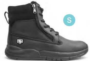
Trail Worker Oil Black