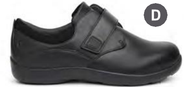
Casual Double Depth Black Stretch