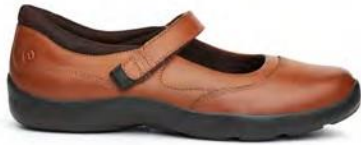
Casual Mary Jane Cognac