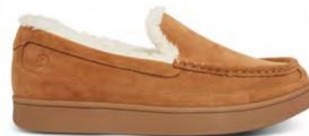
Moc Toe Camel