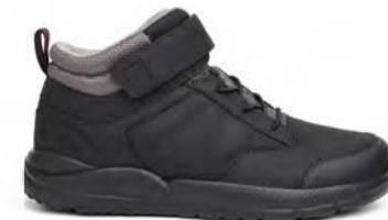
Trail Boot Oil Black