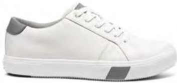
Casual Sneaker White