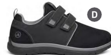
Sport Double Depth Black/Grey