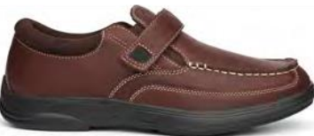
Casual Dress Whiskey