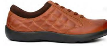
Casual Sport Saddle