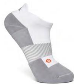
No Show White