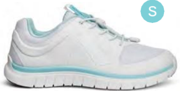
Sport Runner White/Blue