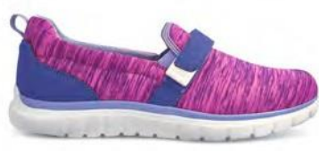
Sport Trainer Purple/Pink