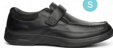
Casual Dress Black