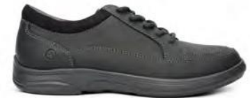
Casual Sport Oil Black