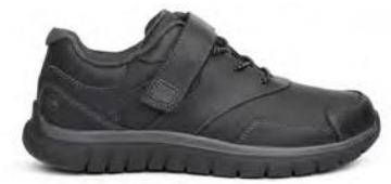
Sport Walker Black