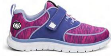
Sport Jogger Purple/Pink