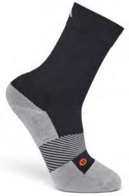
Crew Length Black