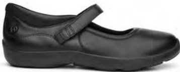
Casual Mary Jane Stretch Black Stretch