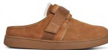
Open Back Camel