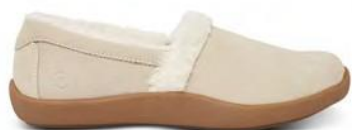
Smooth Toe Sand