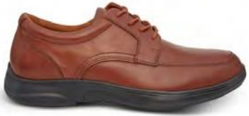
Casual Oxford Burnished Brown