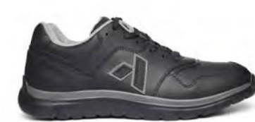
Sport Trainer Black