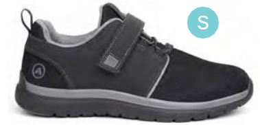
Sport Jogger Black/Grey