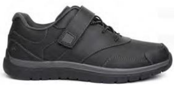
Sport Walker Black