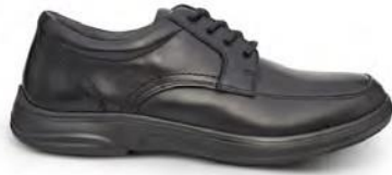
Casual Oxford Black