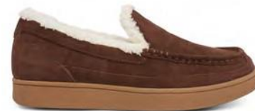
Moc Toe Espresso