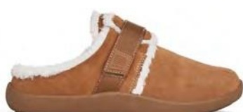
Open Back Camel