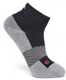
Quarter Length Black