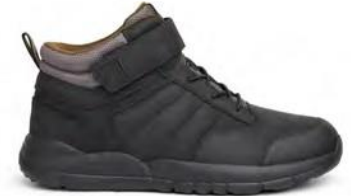
Trail Boot Oil Black