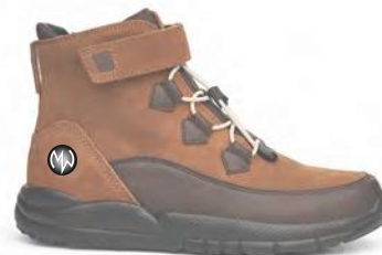
Trail Hiker Almond