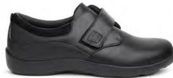
Casual Comfort Stretch Black Stretch