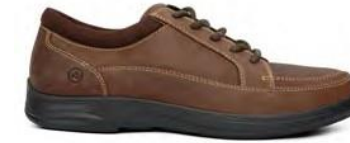
Casual Sport Oil Brown