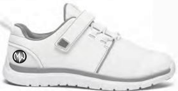
Sport Jogger White/Grey