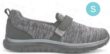
Sport Trainer Black/Grey