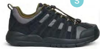
Trail Walker Dark Grey