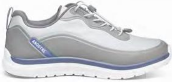
Sport Sprinter Grey