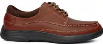
Casual Dress Whiskey