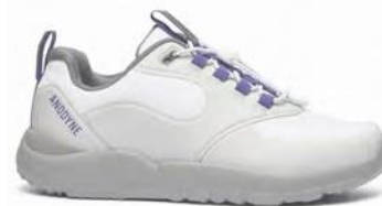
Trail Runner White