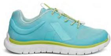
Sport Runner Teal/Lime