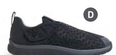
Sport Double-Depth Stretch Black