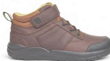
Trail Boot Whiskey