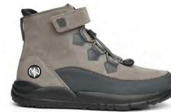
Trail Hiker Grey

The comfort you deserve. The style you desire. The support you require.