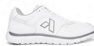
Sport Trainer White