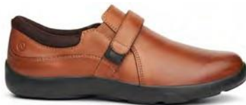
Casual Dress Cognac