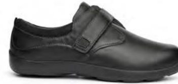
Casual Comfort Black