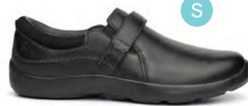
Casual Dress Black