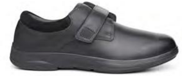
Casual Comfort Black