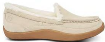
Moc Toe Sand