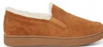
Smooth Toe Camel