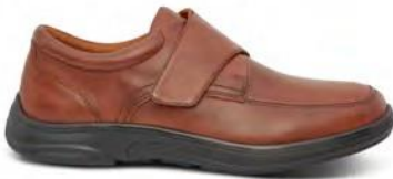
Casual Oxford Burnished Brown