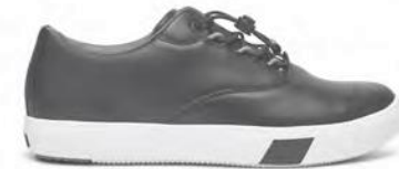
Casual Sneaker Black