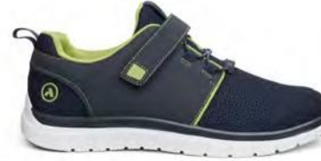
Sport Jogger Blue/Green