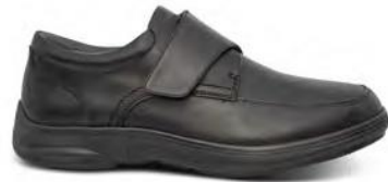
Casual Oxford Black