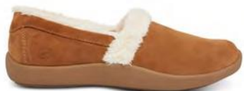
Smooth Toe Camel