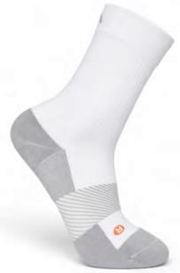
Crew Length White