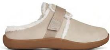
Open Back Sand