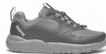
Trail Runner Black