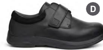
Casual Double Depth Black Stretch