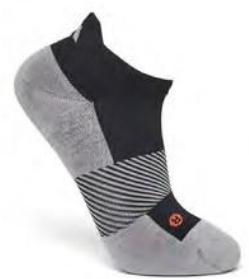
No Show Black