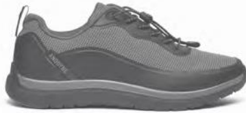
Sport Sprinter Black