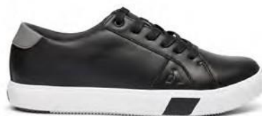
Casual Sneaker Black