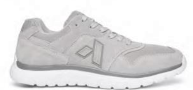
Sport Trainer Grey