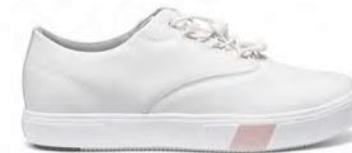
Casual Sneaker White