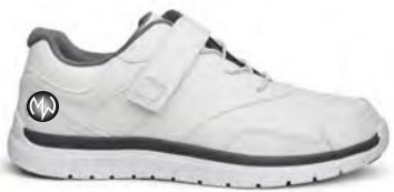
Sport Walker White